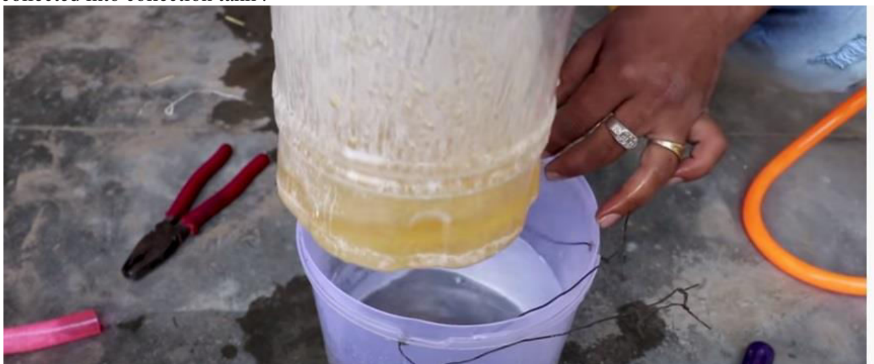
Fig4 final product

In heating chamber waste plastic is heated about 300 ^{\rm o} C , after heating vapor formation started and this vapour further passes through condenser where the vapor condence. And then after condense liquid collected into collection tank .