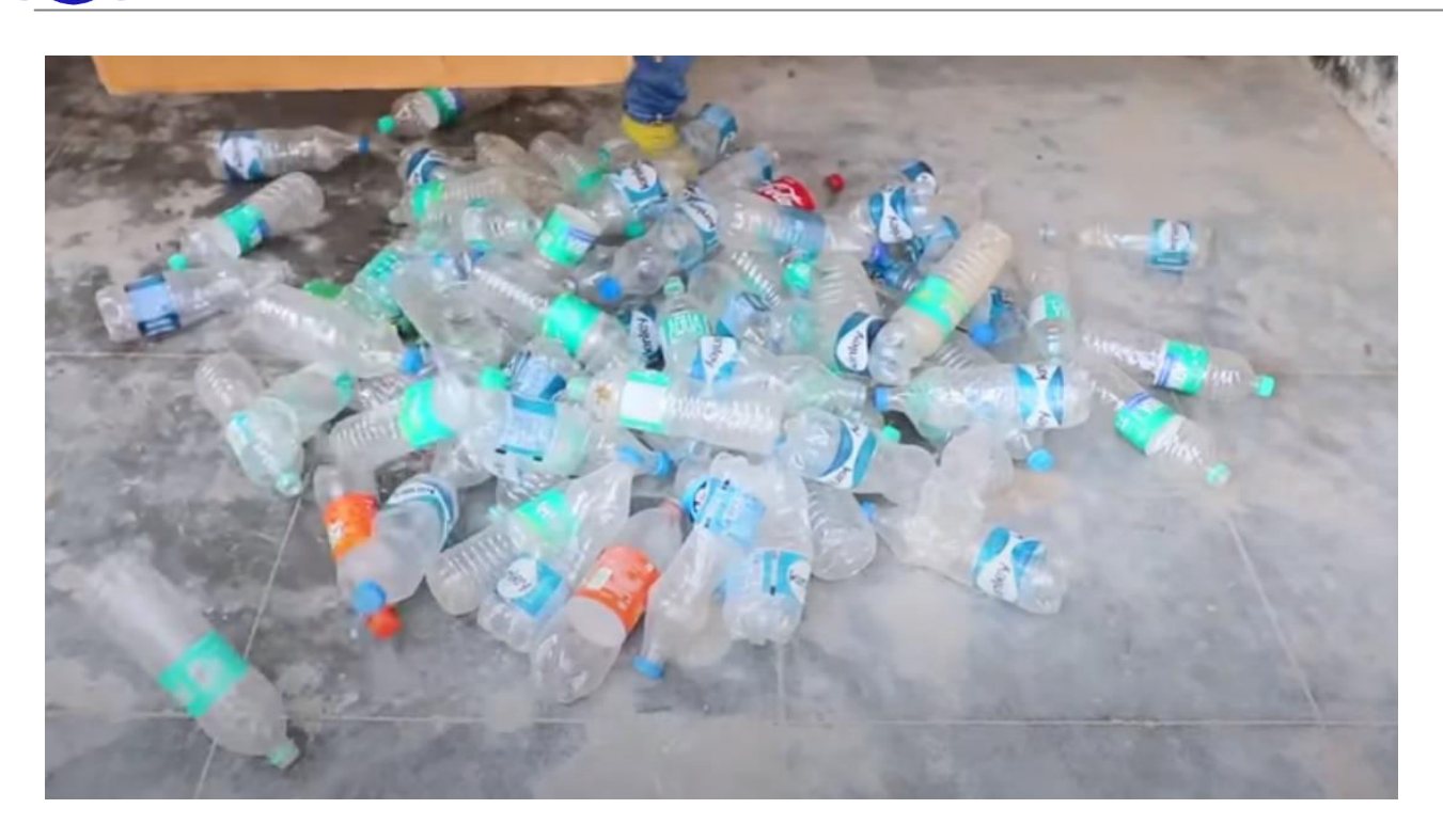
Fig1 Sample of plastic waste to processed

Volume: 04 Issue: 10 | Oct -2020 ISSN: 2582-3930