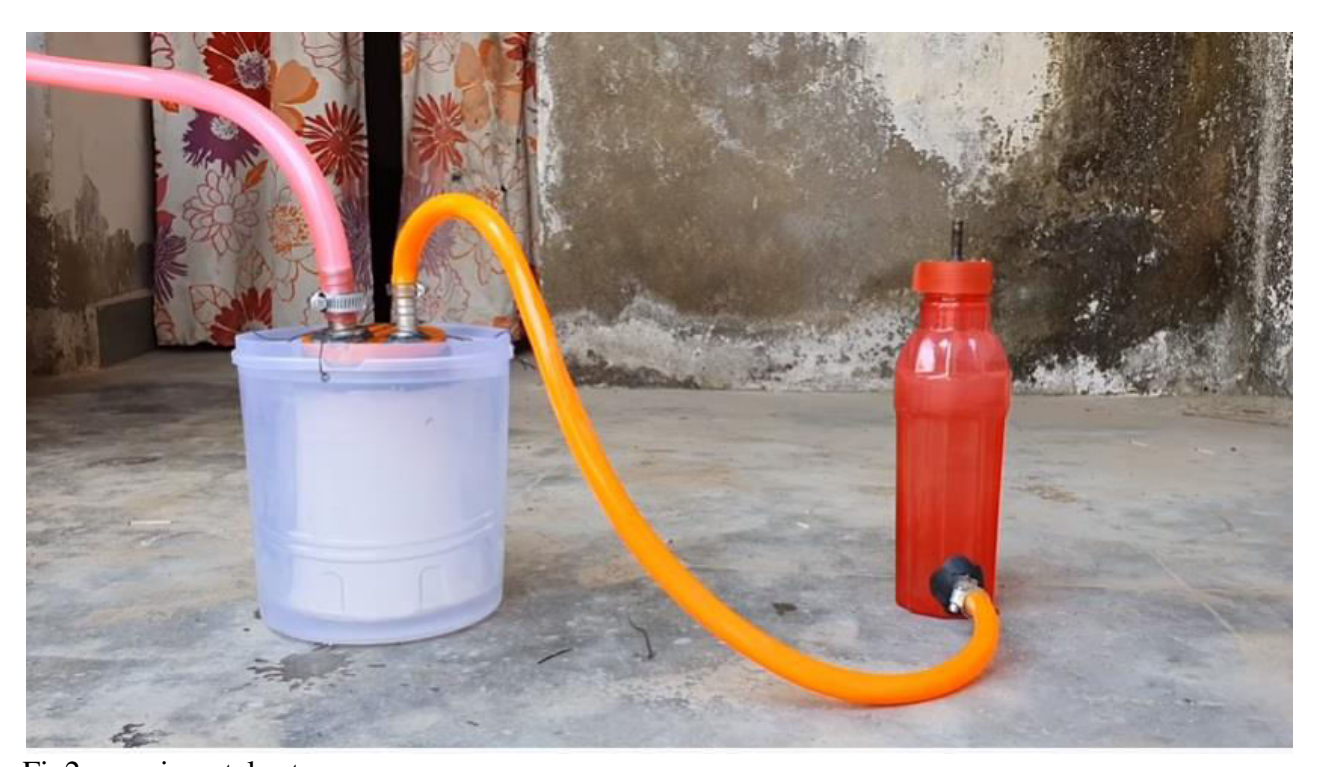
Fig2 experimental setup

This process of conversion of plastic into fuel can be understand by the fig3